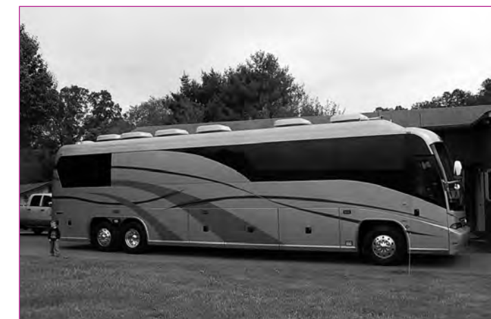
What a nice bus!